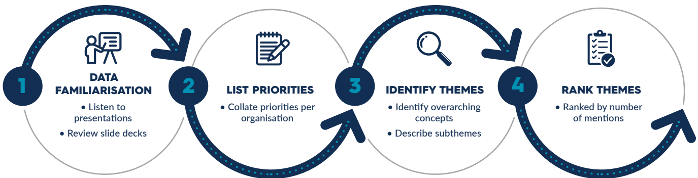
Figure 1: Analysis Methodology

It is important to acknowledge that number of mentions may not accurately represent the actual level of priority for each theme, due to the following observations from the analysis: