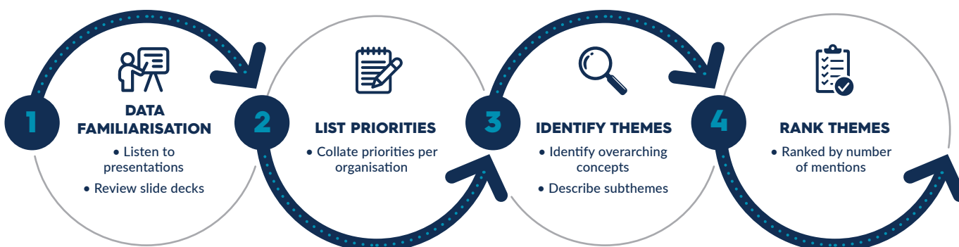
Figure 1: Analysis Methodology

It is important to acknowledge that number of mentions may not accurately represent the actual level of priority for each theme, due to the following observations from the analysis: